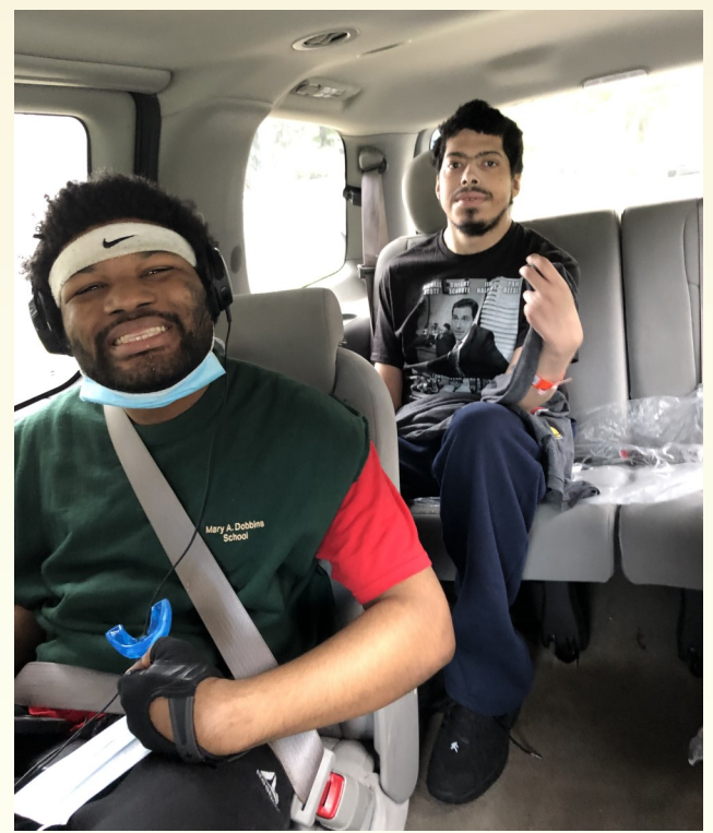
On the Road! Sawtelle Haledon residents are off to Party City!

Youth on the Kilbarchan Campus celebrated the start of summer with a talent and art show. Afterwards, the staff and the residents enjoyed a BBQ together.